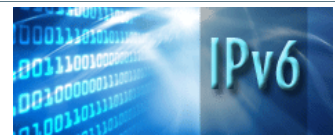
IPv6 security: Everything old is new again