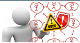
Aussie "family" social network fails security basics