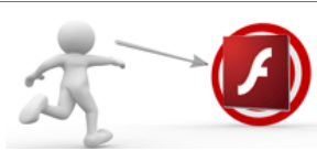
Flash exploits increase 40 fold in 2011