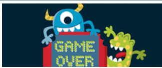
Sony PSN hit by mass password attack

Industries Data Protection Identity & Access Business Continuity Physical Security Security Leadership Career Training